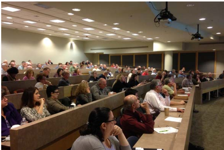
Tax Topics: More than 100 tax preparers attended the Division of Taxation's "Seminar for Tax Preparers" (see above) held at the Community College of Rhode Island's Knight Campus in Warwick on November 4, 2016.

(Coverage of the 2017 filing season, for tax year 2016, begins on page 2.)