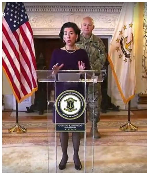
Screenshot of broadcast on WJAR-TV (NBC 10)

The due date for resident and nonresident Rhode Island personal income tax returns – and any associated payments, regardless of the